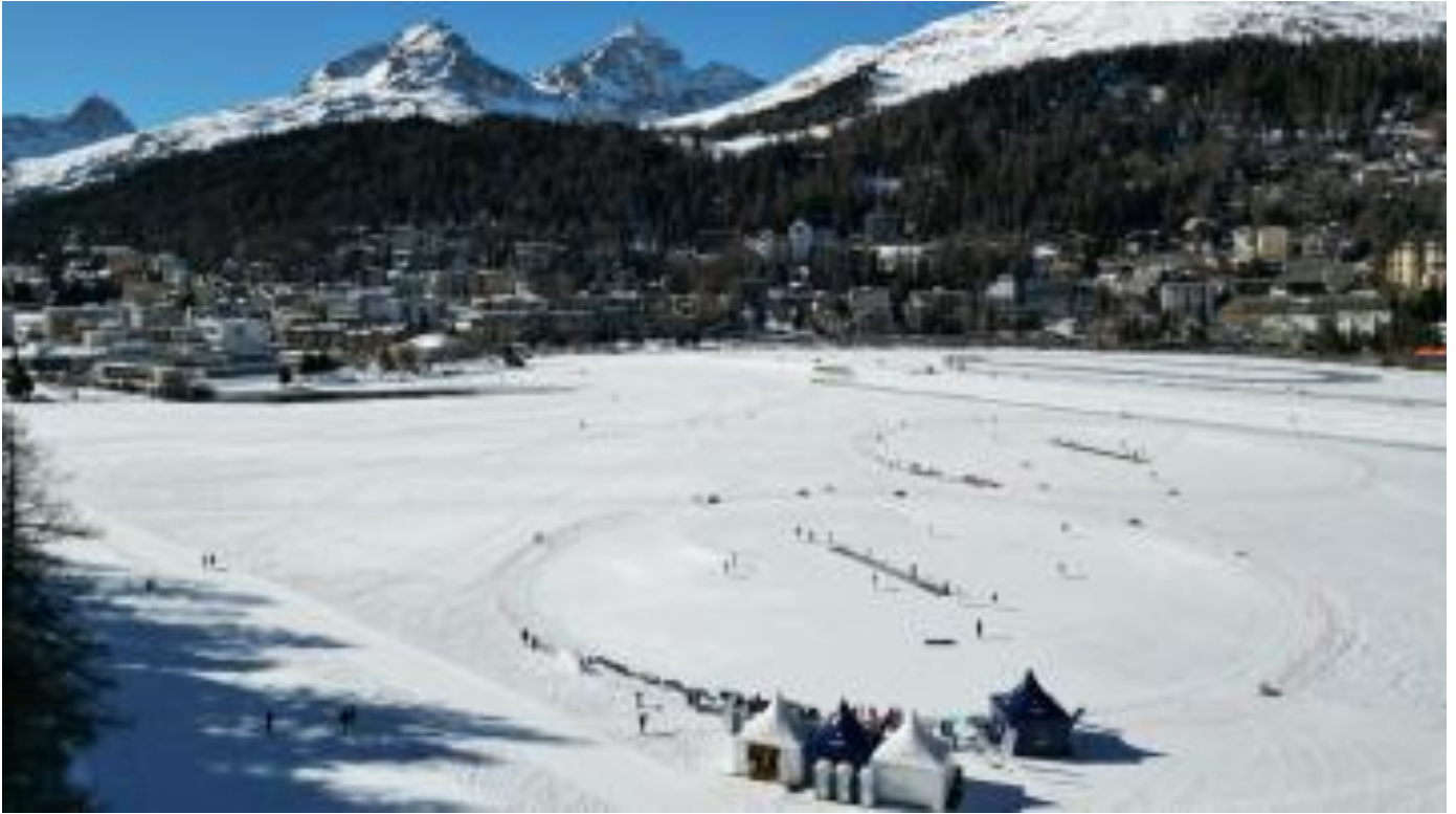
Figure 1 The pitch on the lake in St Moritz, Switzerland, where the Cricket on Ice tournament took place

https://www.thetimes.co.uk/article/cricket-on-ice-in-st-moritz-matches-played-on-frozen-swiss-lake-tzptp6jp9